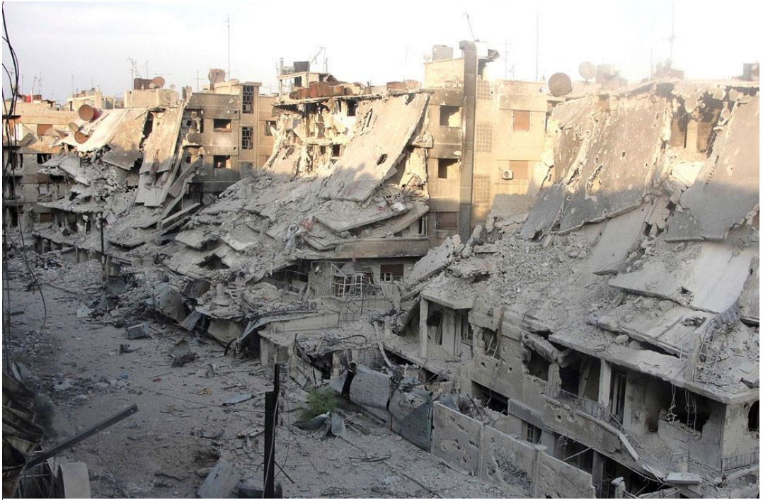
Destroyed buildings in besieged city of Homs.

One Syrian study estimated that the number of war-damaged homes reached "half a million," of which about 390,000 are completely destroyed. Their reconstruction is estimated to cost US$60 billion (€44,280,800,000). The same source counted some 700,000 Syrian families, or nearly 2.8 million people, with no place to return to.